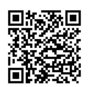
Google Play (Android)